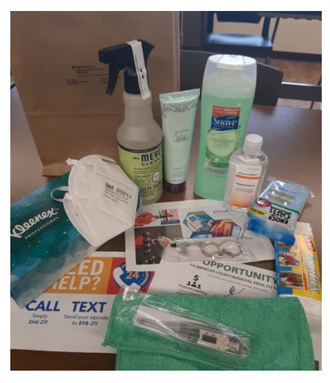
Care Kits for Uptown residents, including those who are unhoused

As the UpTown Community Coalition matures, they gain more opportunities to deepen community collaboration. They have momentum engaging businesses, social service providers, community-based organizations, and several residents who share a commitment to addressing the upstream factors that impact health and well-being. While this initial engagement holds promise, the coalition continues to pursue deeper connections with more residents, particularly unhoused ones. To address this, ProMedica has partnered with Cherry Street Mission to identify homeless individuals to sit on the coalition and expressly represent a population that rarely has a seat at the table. Knowing that ProMedica must create partnerships beyond individual involvement, ENP provides funding and resources to homeless providers in the neighborhood. In addition, ProMedica recently provided funding to the Toledo Lucas County Homelessness Board to develop a shared strategic plan to address homelessness in UpTown.